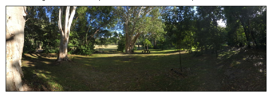
Photo looking North towards the picnic area from near the access path

This area is ideally suited for picnics and BBQs. It is a relatively open grassed area with some excellent shade trees and in close proximity to parking, the 1770 visitors centre and the cricket oval. The old and tired picnic tables would be replaced with new settings and BBQ facilities and would benefit from the inclusion of one or two shelters. Shelters could be a simple and cost effective structure such as the skillion roofed structure a more elaborate style like a Gazebo.