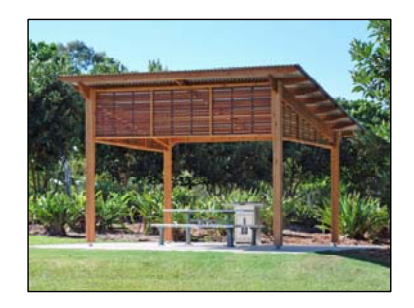
Skillion Roofed Style Shelter