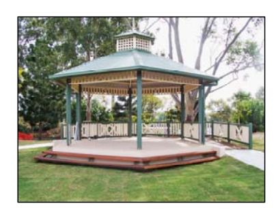
Gazebo Style Shelter